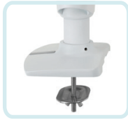
WHITE GROMMET MOUNT KIT ACCESSORY 98-035: ATTACHES THROUGH SURFACE HOLE