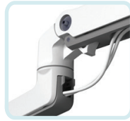
CABLES ROUTE BENEATH THE ARM, OUT OF THE WAY