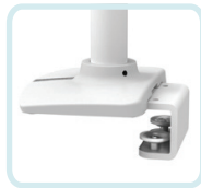
WHITE UNDER MOUNT C-CLAMP ACCESSORY 98-082: ATTACHES TO SURFACE EDGE