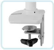
INCLUDED: STANDARD 2-PIECE DESK CLAMP ATTACHES TO SURFACE EDGE